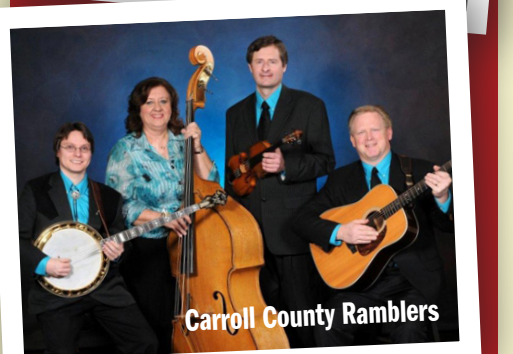
Carroll County Ramblers